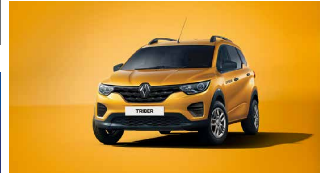
HONEY YELLOW (MP)

NM: Clearcoat Opaque; MP: Metallic Paint