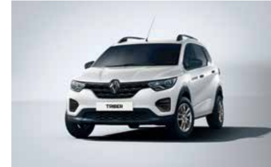
ICE COOL WHITE (NM)