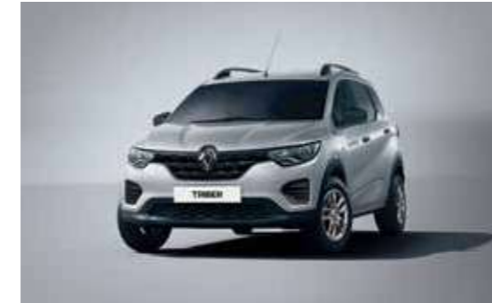
MOONLIGHT SILVER (MP)