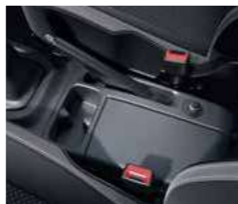
Centre console storage