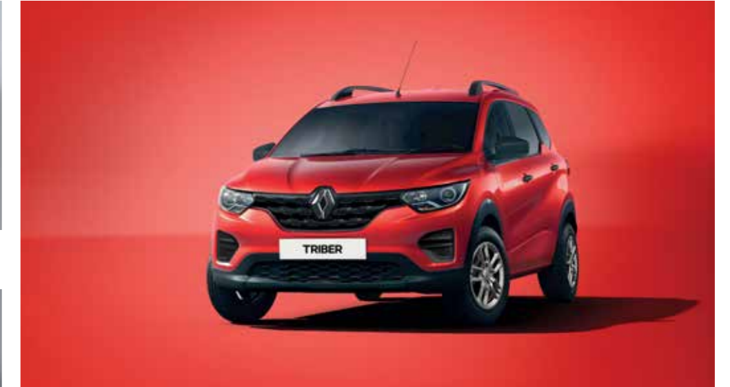
FIERY RED (MP)