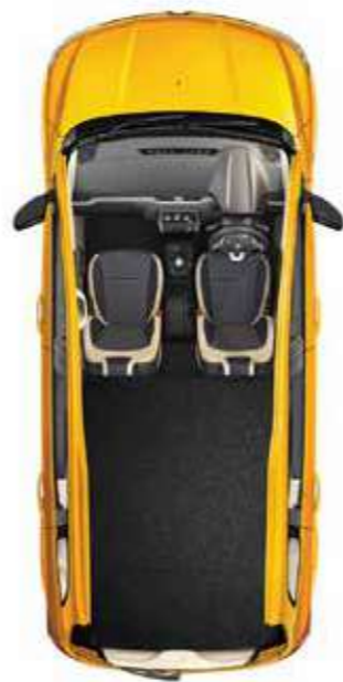
1 500 litre cargo load area 542kg payload