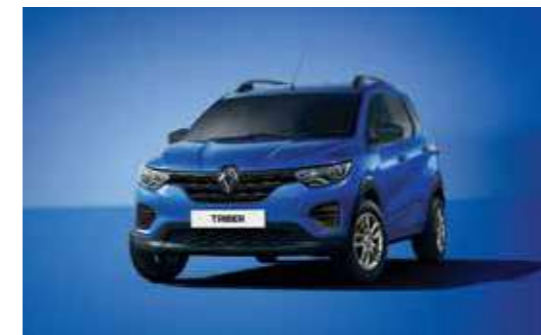
ELECTRIC BLUE (MP)