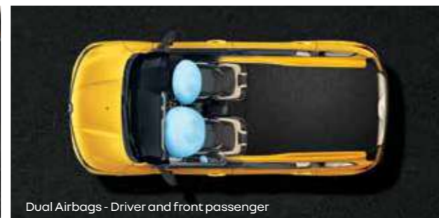
Dual Airbags - Driver and front passenger