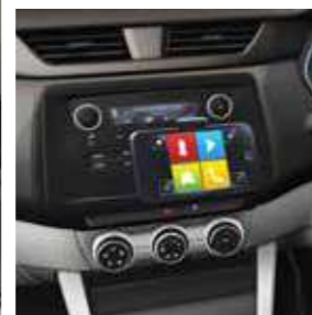
R&Go® radio with additional accessory smartphone mount