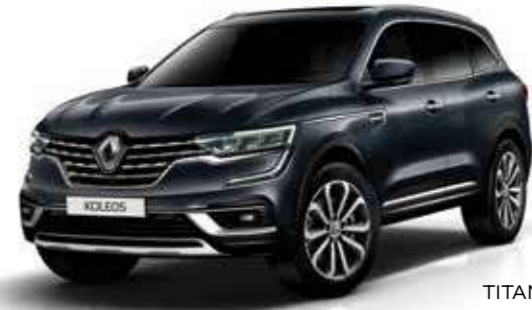
TITANIUM GREY (MP)