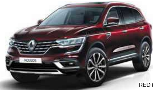
RED MILLESIME (MP)

Note: Printing limitations do not permit subtle paint shades to be shown with complete accuracy.