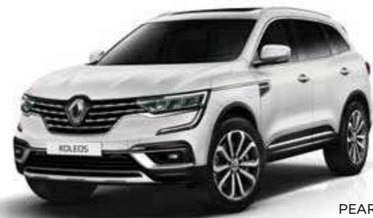
PEARL WHITE (MP)